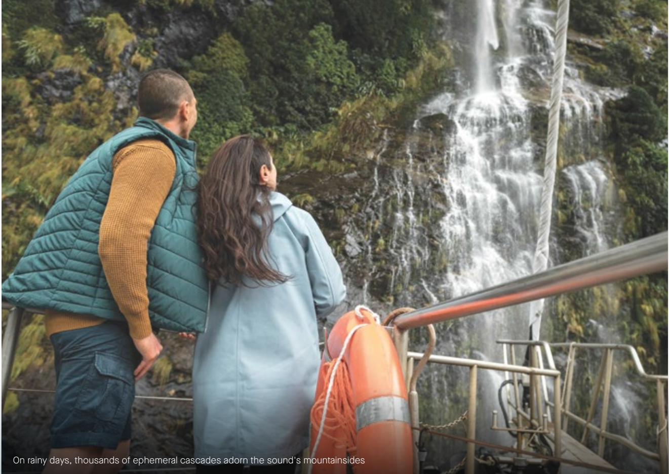
On rainy days, thousands of ephemeral cascades adorn the sound's mountainsides

and spacious viewing decks. Inviting shared spaces frame views that need no embellishment, offering a sense of comfort that complements, rather than competes with, the grandeur outside.